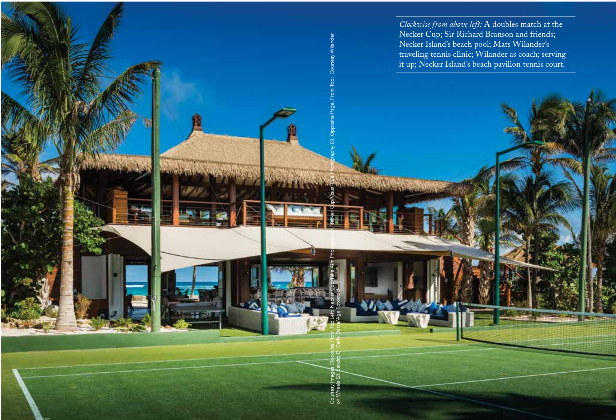
Clockwise from above left: A doubles match at the Necker Cup; Sir Richard Branson and friends; Necker Island's beach pool; Mats Wilander's traveling tennis clinic; Wilander as coach; serving it up; Necker Island's beach pavilion tennis court.