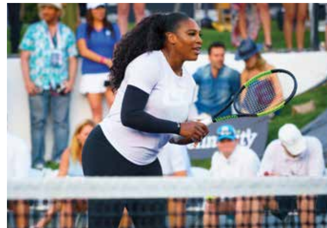
From top: Desert Smash in Palm Springs; Tennis With the Stars in Rancho Mirage; the Chris Evert/Raymond James pro-celeb classic; Serena Williams at Desert Smash.